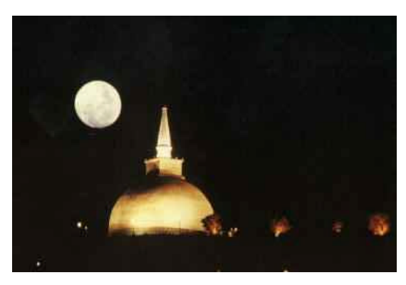
Translated from Pali