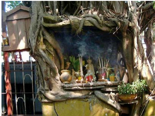
Novice must show their face to the Tree Deities at the tree-shrine

It is a village tradition to show the novices to the village tree deities at their tree shrine as a way of paying respect to the terrestrial Devas, the village spiritual guardian Deva that this young novice-t-be will soon enter into samanera (novice). This ritual is not so evident in urban areas.