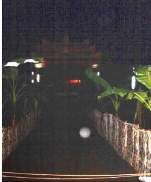
Luminous Relic Ball Formation (Image – 2)