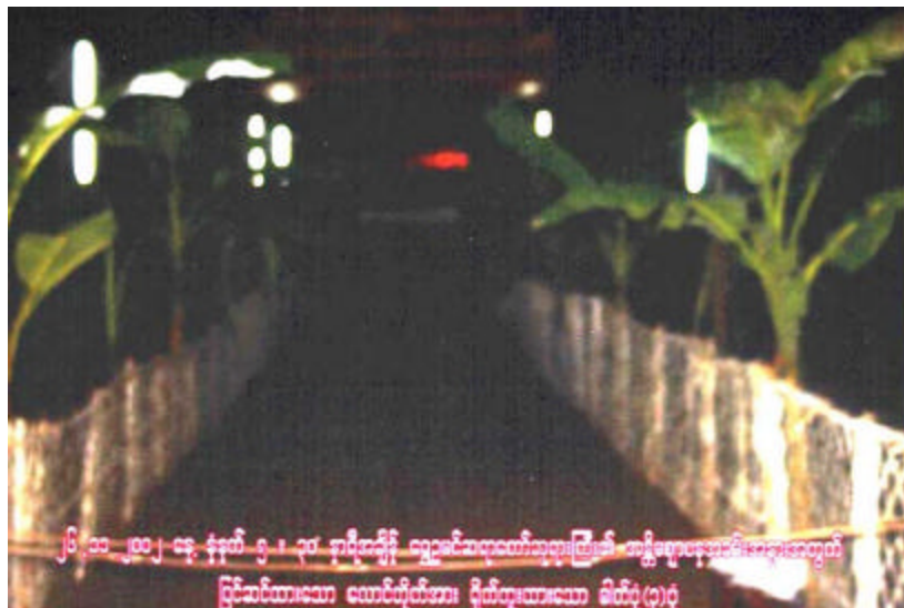
Cremation Pier (Image – 1)