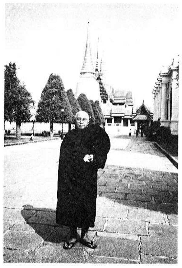
Chanmayay Sayadaw 30.Dec. 96