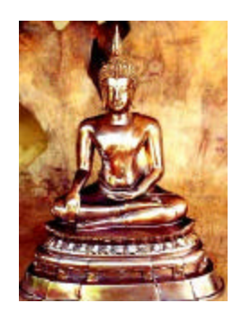
Wood I mage or Bronze I mage

Palm Open or Palm Down I mages are available in the Market