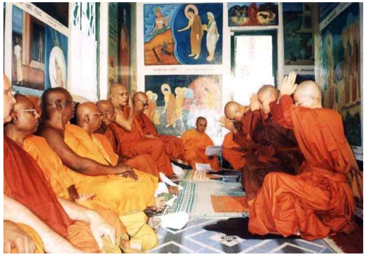
Full Bhikkhuni Ordination